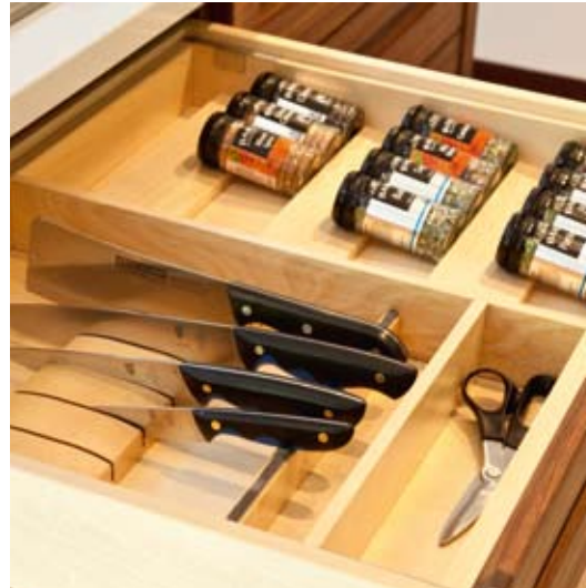
Left: The top two drawers in the island feature wooden cutlery inserts including dedicated slots for knives and spices, ensuring they are always neatly stored and easy to access