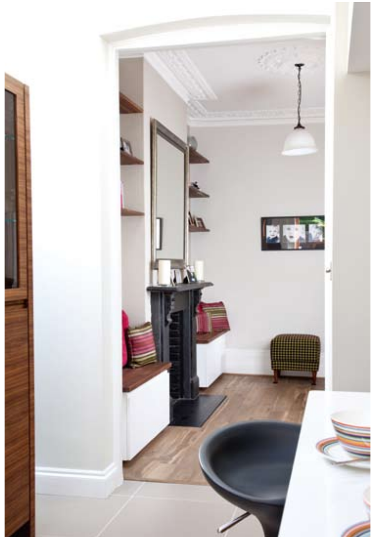
Above right: White units and walnut shelving were also created by Sola in the adjoining playroom to create visual fluidity between the two rooms. Walnut flooring also ensures unity between rooms while giving the play area its own distinct character

“We particularly wanted lots of drawers as this was where our previous kitchen was lacking and we now have seven built into the base of the island, which is fantastic,” says Gaynor. Moreover, as they wanted three large drawers on one side and four smaller ones on the other, Sofia has skilfully linked the interior of the second and third drawer together, whilst creating the appearance of two separate drawers from the outside for a symmetrical look.