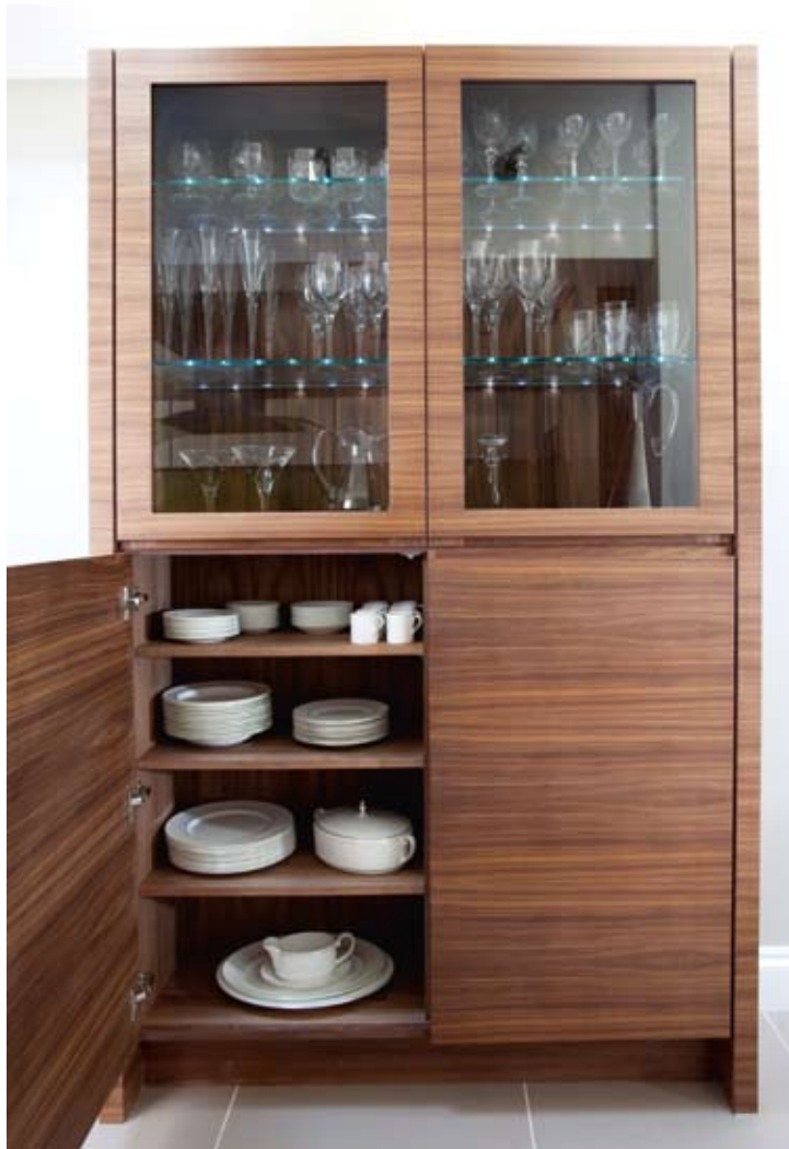
Above left: The couple wanted a walnut dresser to store all their good glassware and tableware in but something that was relatively modern to tie in with the rest of the kitchen. Thus, this unit is entirely handleless and free of embellishment, save for tiny LED lights on the shelves, providing an ambient effect by night